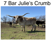
7 Bar Julie's Crumb